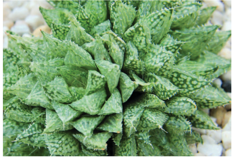
Haworthia Michael Coccozza CC 1056