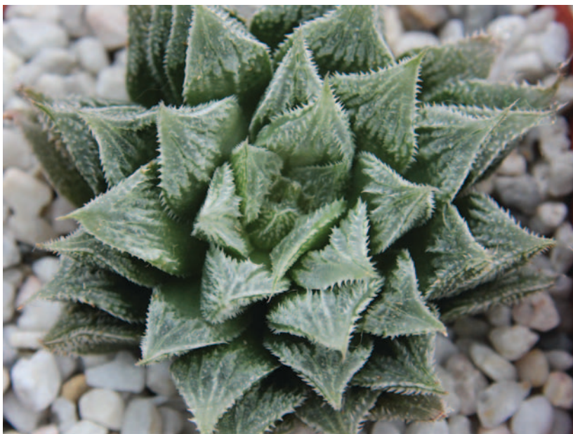
Haworthia Quilla CCO 378