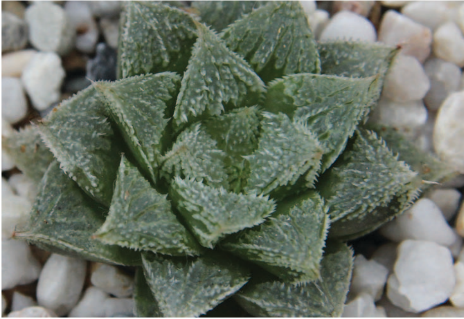
Haworthia Bunter CC 3455