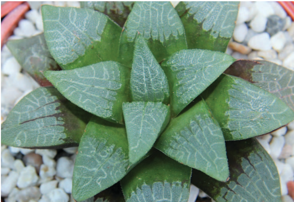
Haworthia bayeri CCO 604 from seed 1996