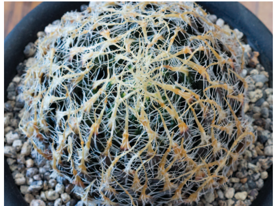
Haworthia arachnoidea var. gigas

Light refreshments and plant sales will be available