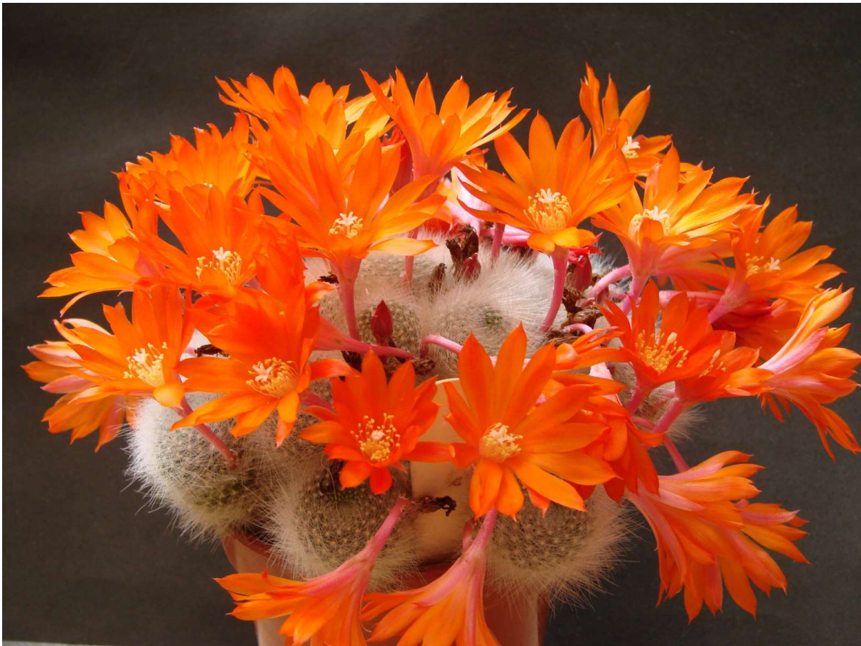
Rebutia albipilosa, 9 June 2017